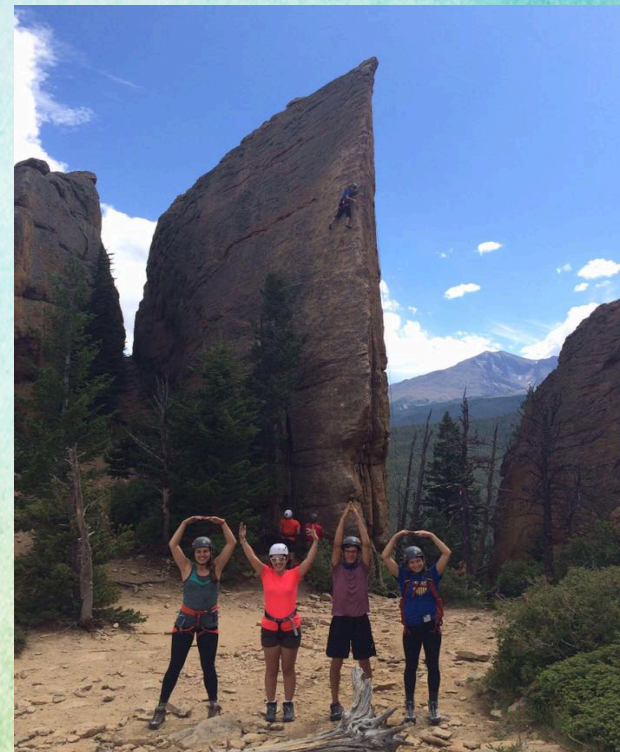
I'm the tiny speck on the rocks! This is one of my favorite outdoor climbs!