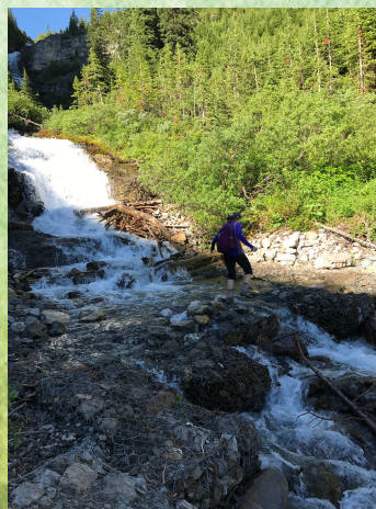
I love adventuring, especially near water!