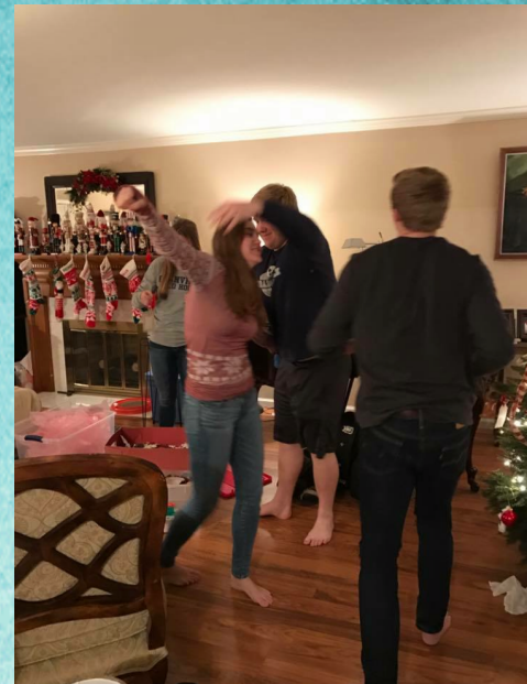
I'm not much of a dancer, but sometimes my brother can convince me into it.

I have spent much of my life knowing that one day I want to work with children, and I have finally realized that I don't have to wait until I graduate med school in order to fulfil that dream of mine. Growing up, I lived off of skinned knees, stubbed toes, muddy feet and grass stained clothes, and this attitude has driven me to invest 100% in whatever I set my mind to, and I am so excited to spend my summer with people who feel the same way. I love running until my legs are tired, laughing until my stomach hurts, and smiling until my smile can't get any bigger. I'm really excited to spend the nights filled with giggles in a cabin of girls, and the days swinging from ropes high up in the trees. I am so much looking forward to all of the love that I will give and receive by hanging out with the Manzi village! When you see me, come up and give me a big hug! There is nothing better than a big bear hug from a friend!