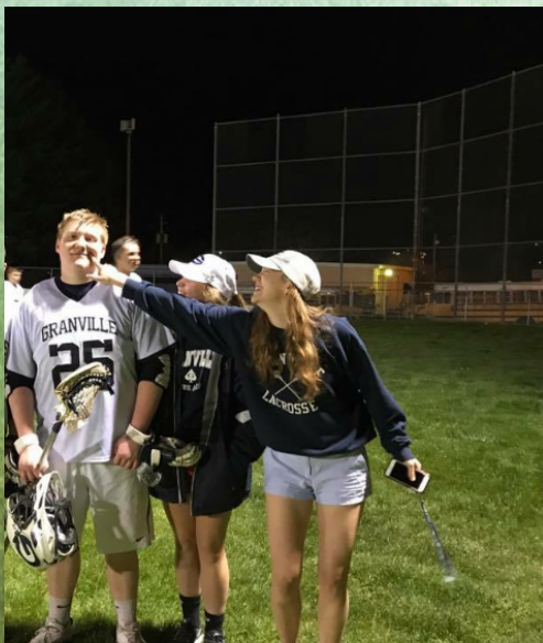
I love making people smile, especially my little brother 😊